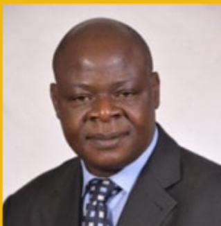
ALBERT OBBUYI CENTRE FOR THE STUDY OF ADOLESCENCE, NAIROBI