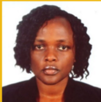
HELLEN OWINO CENTRE FOR THE STUDY OF ADOLESCENCE, NAIROBI